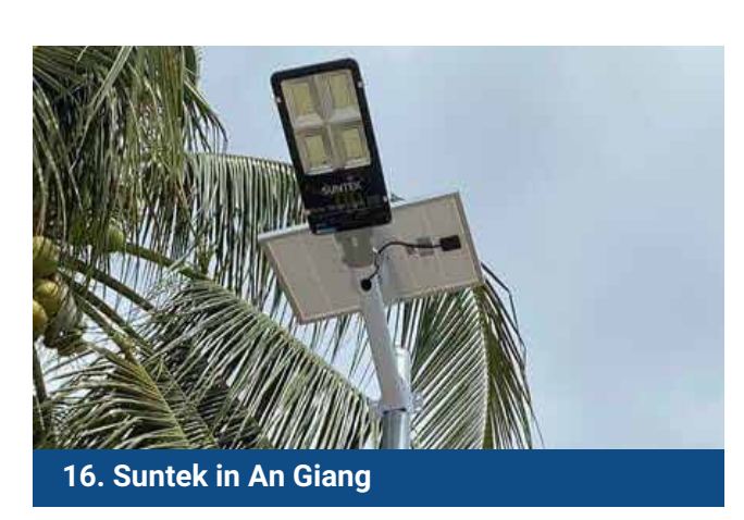
Project: "Lighting up rural roads" by Ho Chi Minh Youth Union in An Giang Province Place of installation: Le Tri Commune, Tri Ton District, An Giang Province Product installed: SUNTEK S150