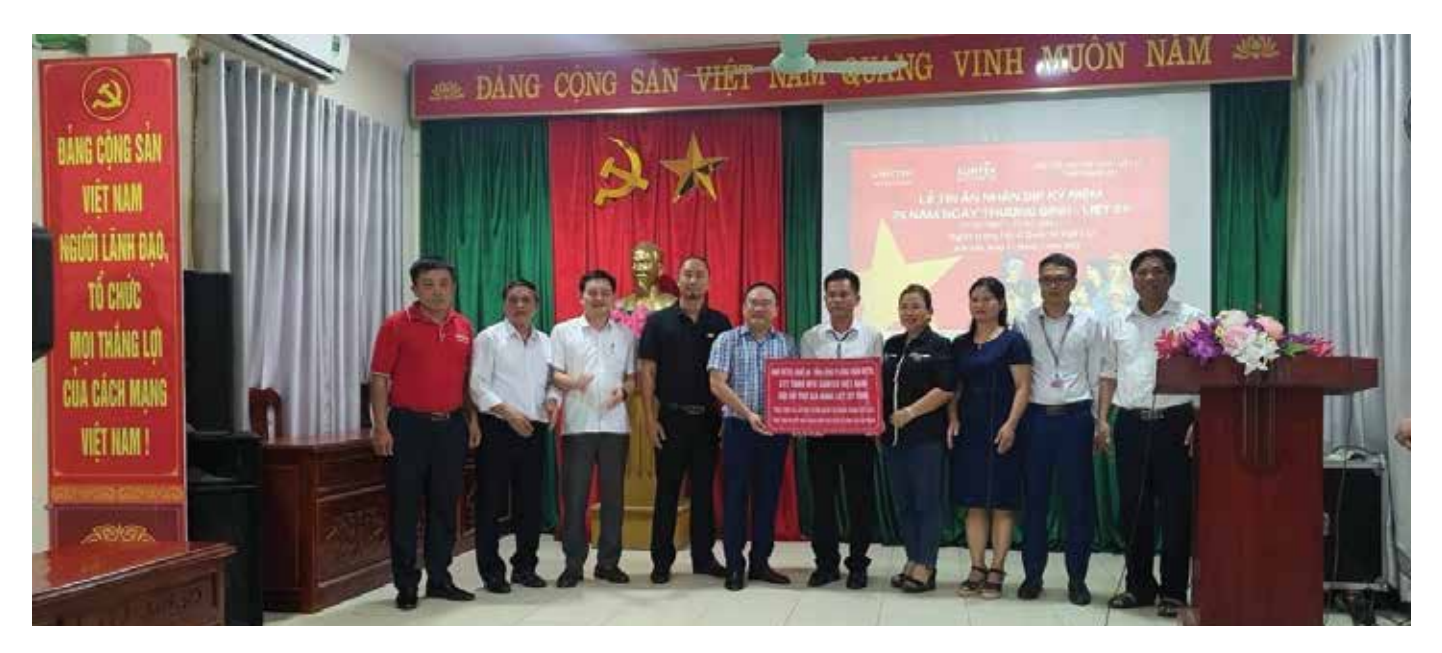
Youth's Work: Bringing light to the sacred lands, Vietnam – Laos International Martyrs' Cemetery in Anh Son District, Nghe An Province