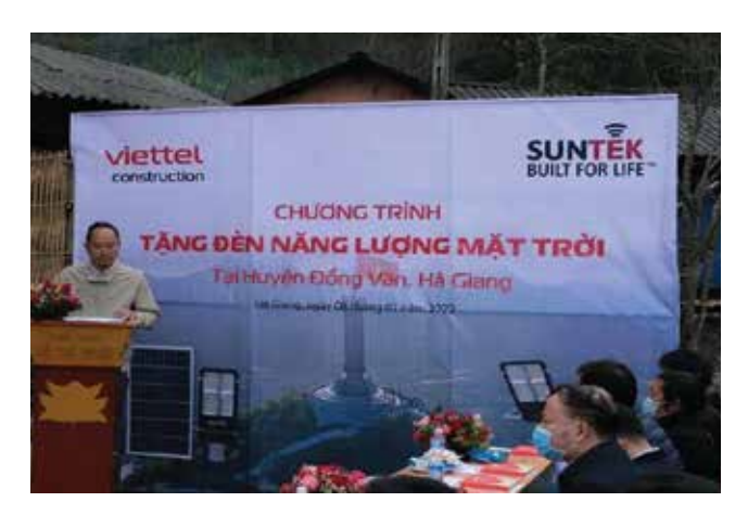
Giving SUNTEK solar lights to poor villages in Dong Van District, Ha Giang Province