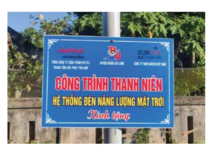
Youth's Work: Bringing light to the sacred lands, Gio Linh Martyrs' Cemetery in Gio Linh District, Quang Tri Province