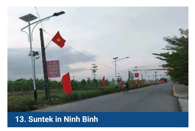
Project: Solar lighting system in Yen Lam Commune, Yen Mo District, Ninh Binh Province Product installed: SUNTEK SP-S798