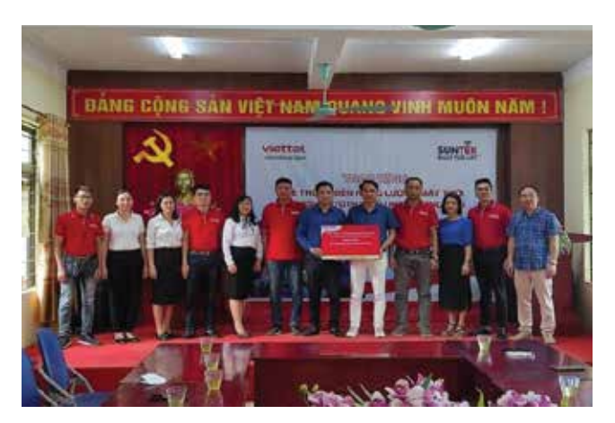
Project: Bringing light to Trung Chai Boarding Primary School for Ethnic Minorities, Trung Chai Commune, Sa Pa Town, Lao Cai Province.