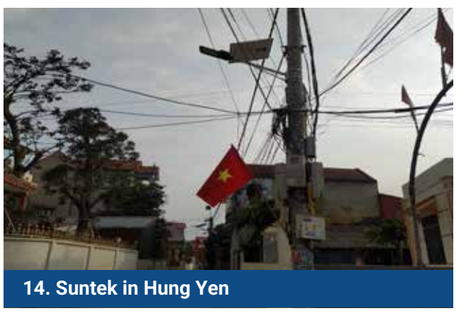
Project: New rural lighting system using Solar lights Place of installation: Van Giang Town, Van Giang District, Hung Yen Province