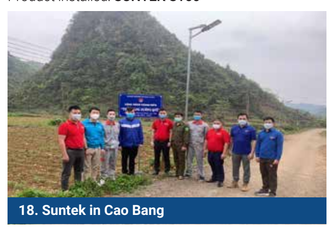
Project: "Lighting up rural roads" by Ho Chi Minh Youth Union in Cao Bang Province Product installed: SUNTEK SL90